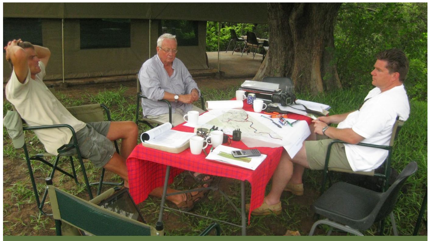
Workshopping a sustainable business plan for Gonarezhou National Park - 2009