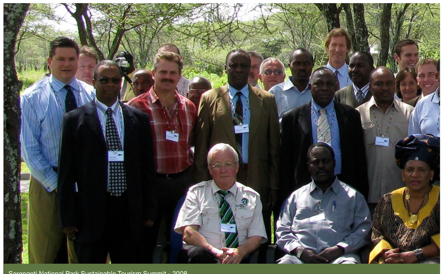
Serengeti National Park Sustainable Tourism Summit - 2008